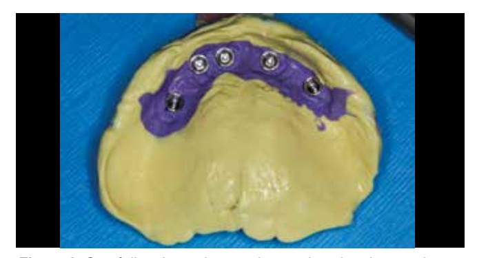
Figure 3: Carefully reinsert impression copings into impression.