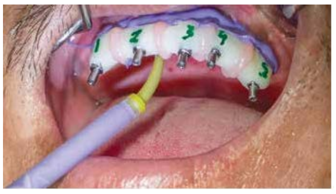
Figure 14: Inject impression material under the implant verification jig

Confirm the occlusion. Make adjustments as necessary.