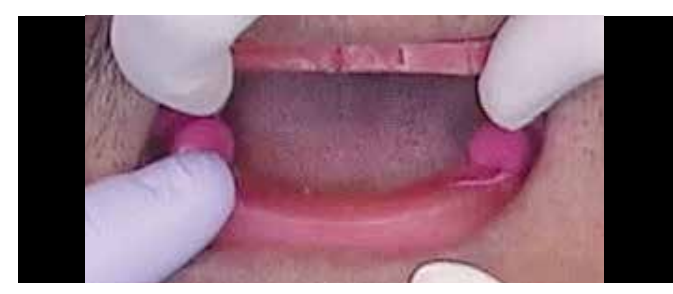
Figure 5: Seat the bite block.