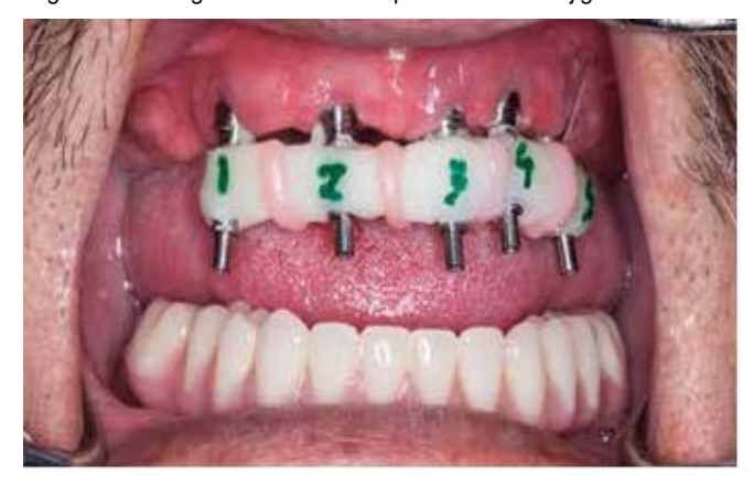
Figure 12: Implant verification jig luted together