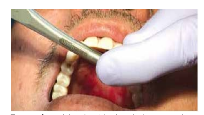
Figure 16: Occlusal view of provisional prosthesis in place and tightening the prosthetic screws to the appropriate torque.