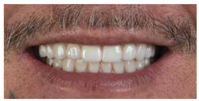
Figure 19: Confirm occlusion.