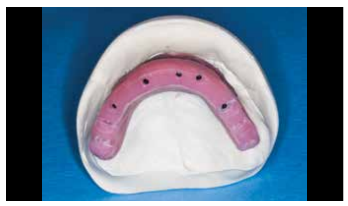
Figure 4: Bite block with temporary cylinders.