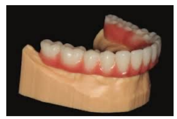
Printed Prototype for Dual Prototype Technique