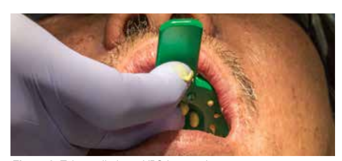
Figure 2: Take preliminary VPS impression.