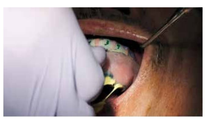
Figure 15: Seat the filled impression tray