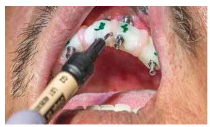
Figure 11: Luting sections of the implant verification jig